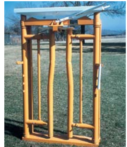
The lengthened latch allows for wider yoke adjustment.