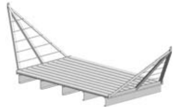
Cattle Guard with Wings